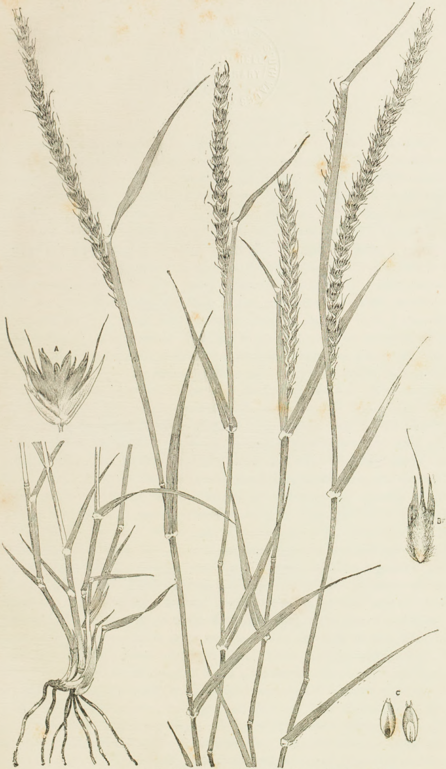
Astrebla triticoides , F.v.M. "Mitchell Grass."